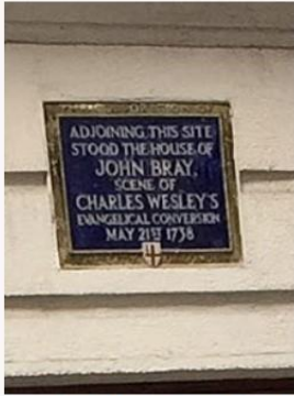
While staying at the home of a friend during a difficult illness, Charles Wesley had a special encounter with the Holy Spirit three days before his brother.

On Pentecost Sunday, May 21, 1738, something amazing happened. Between visits from his brother, his doctor, and those who were taking care of him, Charles had a personal encounter with the Holy Spirit.